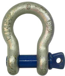
Screw Pin Bow Shackle