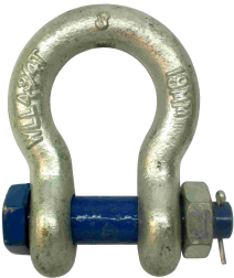
Safety Pin Bow Shackle