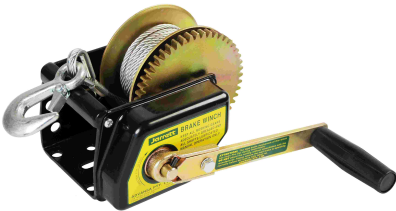
Model. F18230 BRAKE HAND WINCH 5:1 RATIO LINE PULL CAPACITY : 300KG