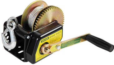
Model. F18210 BRAKE HAND WINCH 3:1 RATIO LINE PULL CAPACITY : 200KG