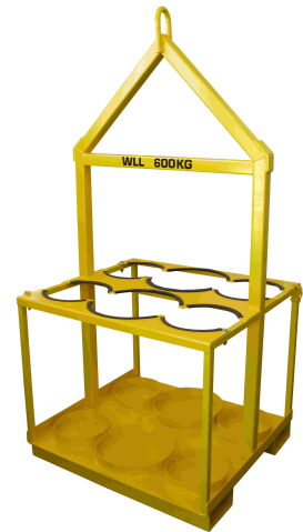
Capacity: 600kg (4x)oxy + (2x)acetylene